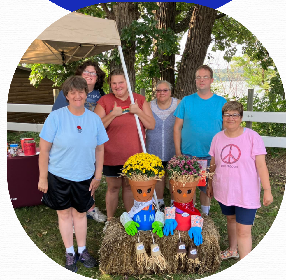
AIM's People First

Advocacy and Inclusion Matter's People First is a group of self-advocates. Self-advocacy is speaking for yourself, choosing for yourself, and working with others to make the community better for everyone.