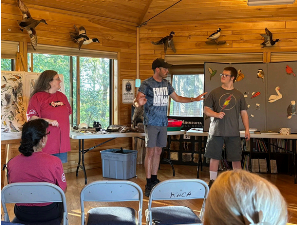
Prairie Woods Environmental Learning Center program