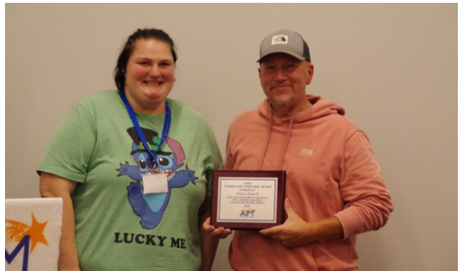
Community Partner Award- Pizza Ranch